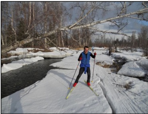
Our Executive Director blazing a new (and daring) trail in the Anchorage area.

The Alaska Trails Initiative (ATI) is really taking off. With an ever-expanding coalition of businesses, agencies and non-profit supporters, ATI continues to galvanize and focus the efforts to highlight trails as an economic engine for Alaska.