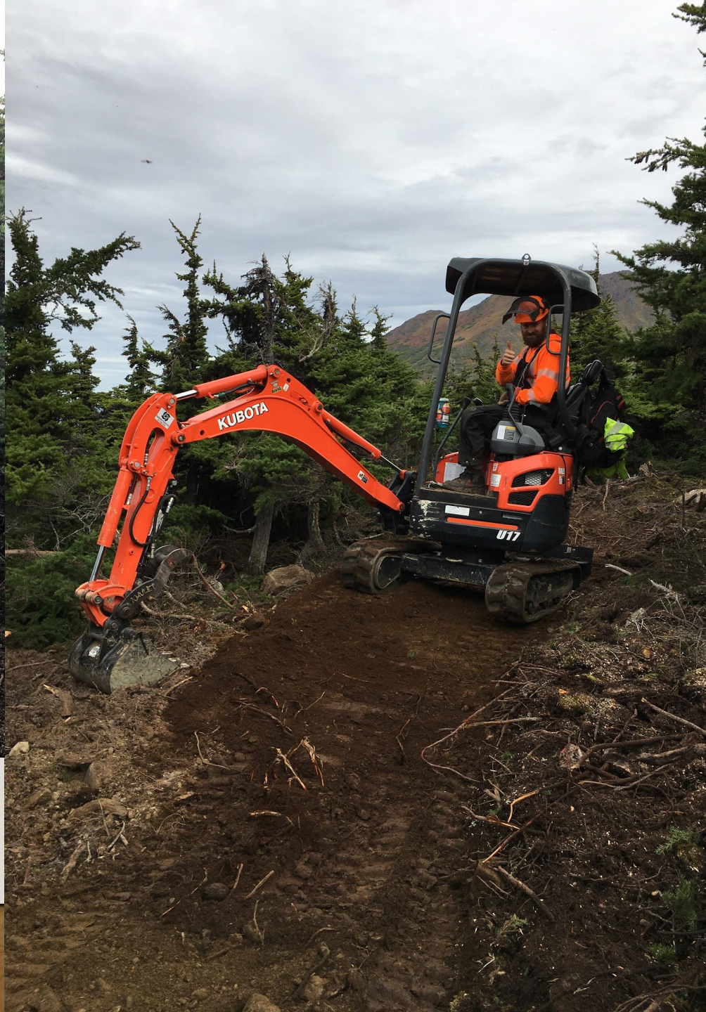
Happy Trails: Sawyers, Sweco, Excavators, Hand Finish