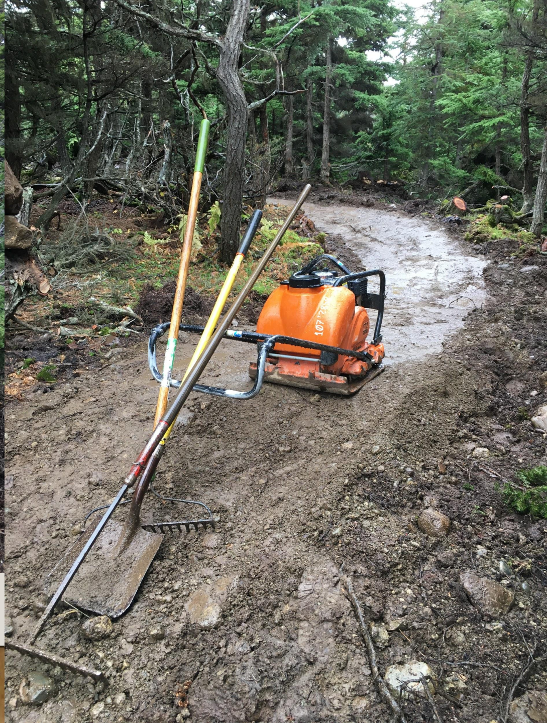
Happy Trails - Hand Finishing