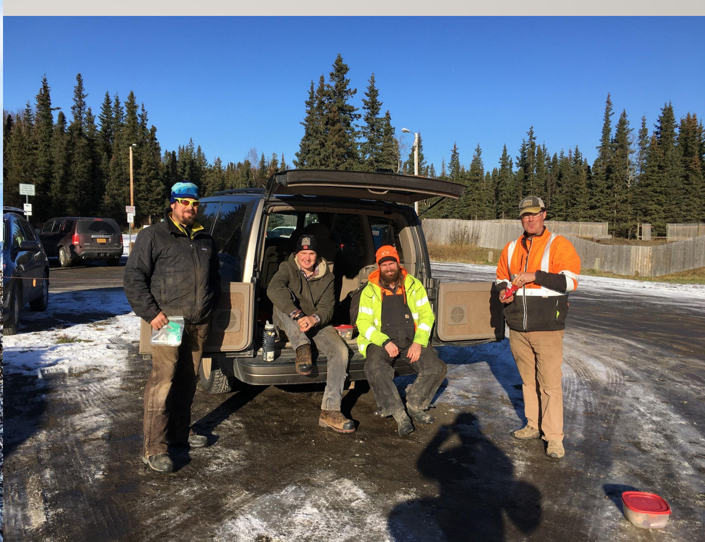
Final Day of Construction (October 2020)