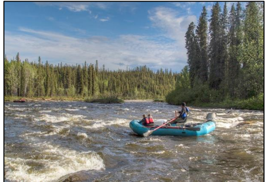
Photo of Gulkana River

The orders eliminating the rivers board (number 134) and the Wood-Tikchik board (number 126) and be found here: http://tinyurl.com/dawvmzaa