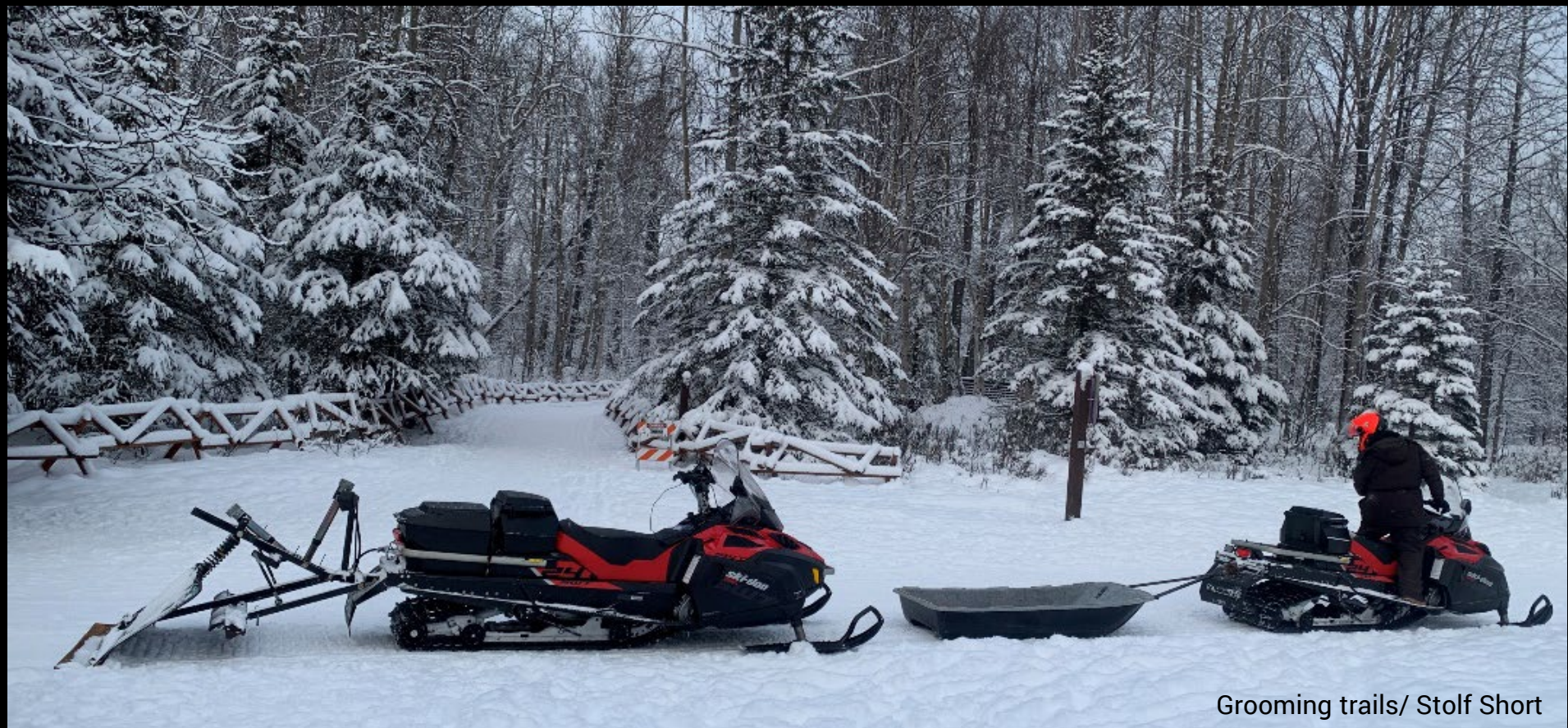
Grooming trails/ Stolf Short