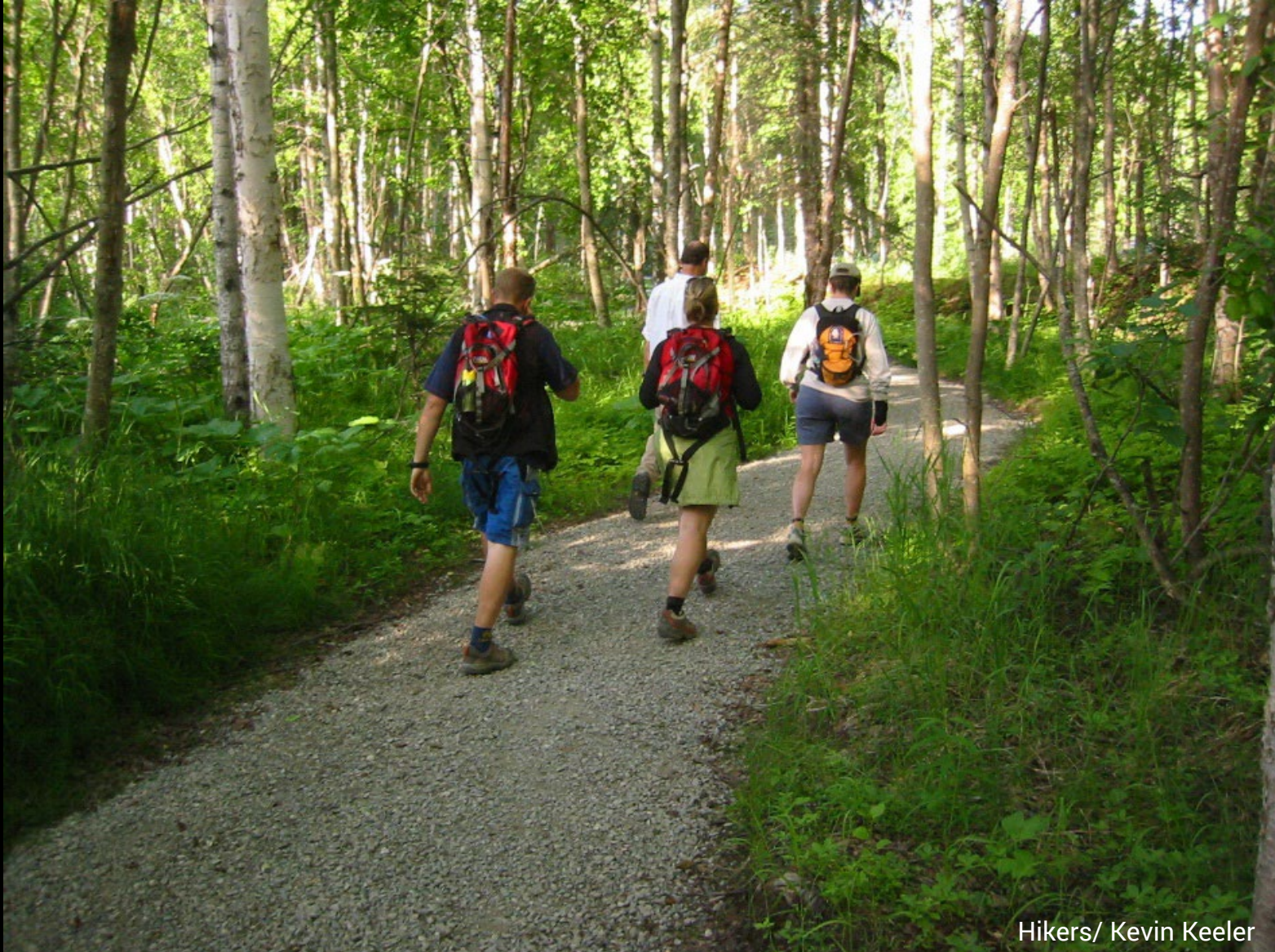
Hikers