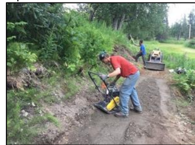
Photo: RTP work on Government Peak Recreation Area trails courtesy of Valley Mountain Bikers and Hikers.