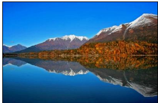
Photo of Lower Trail Lake by Rhonda Lynn, 2020 winner, Sweeping Views category

ENTER The deadline for the Kenai Mountains-Turnagain Arm (KMTA) National Heritage Area photo contest is September 30 . Amateur and professional photographers are invited to submit images that capture the essence of the Kenai Mountains-Turnagain Arm National Heritage Area (KMTA), which includes the area's trails, or speak to KMTA's role in preserving, promoting and protecting the national heritage area. All photographs must be taken within the KMTA area which include the communities of Indian, Bird, Girdwood, Whittier, Hope/Sunrise, Moose Pass, Seward and Cooper Landing. For more info go to https://kmtacorridor.org/photo-contests/