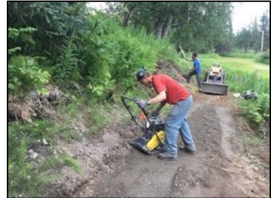
Photo: RTP work on Government Peak Recreation Area trails courtesy of Valley Mountain Bikers and Hikers.