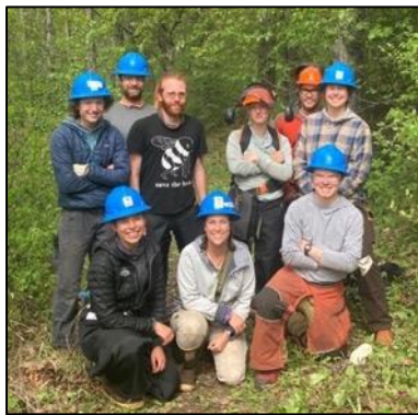
Our two trail crews.

Alaska Trails has two trail crews in the field this summer. Our crew working with the US Forest Service in Cordova has finished up their work out at Child's Glacier and is back on the McKinley Lake trail where they began their season. They will continue working there until mid-September.