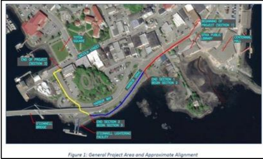
Figure 3. General Project Area and Approximate Alignment

August 2: There is a proposal to extend the Seawalk to O'Connell Bridge!